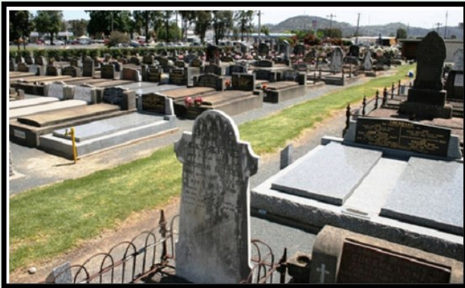
Old Monumental — With sweeping views across the grounds, traditional full monumental graves that endure through generations.