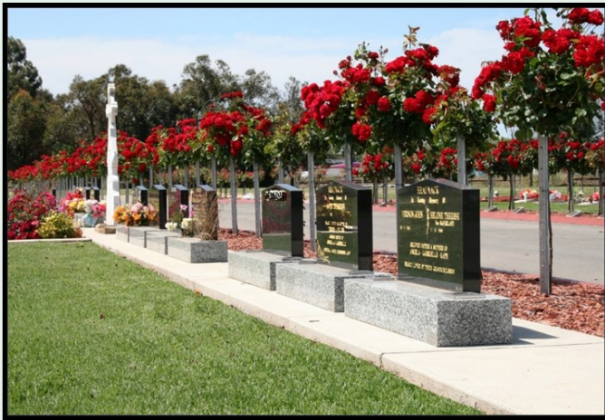
Monumental Lawn — A manicured lawn setting with granite headstones adding a prestigious final touch to honour your loved one.