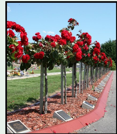
Red Rose Garden

Our Ashes interment sites are situated in unique landscaped areas, choose from Flagpole (white roses), Red Rose, Niche Wall, Memorial Garden and Burgundy Rose.