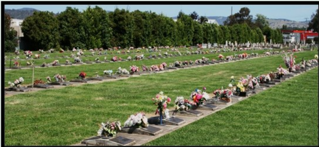
General Lawn section with cast bronze plaques.