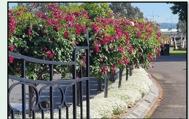
Burgundy Rose Garden